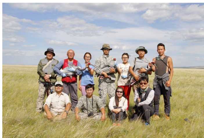
We welcomed researchers from South Korea to join us to unravel the mysteries of White-naped Crane migration. In the photo Korean and Mongolian researchers just before the release of three subadult White-Naped cranes at KKV in July 2015.