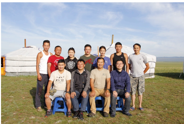
Two delegates from the Poyang Lake National Nature Reserve in China visited KKV in July 2015. It was the first time that Chinese partners officially visited the project site and learned about our work.